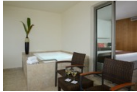
Superior Room with Jacuzzi style tub on the terrace

About what Rooms we may include in our contract proposal: Room Categories